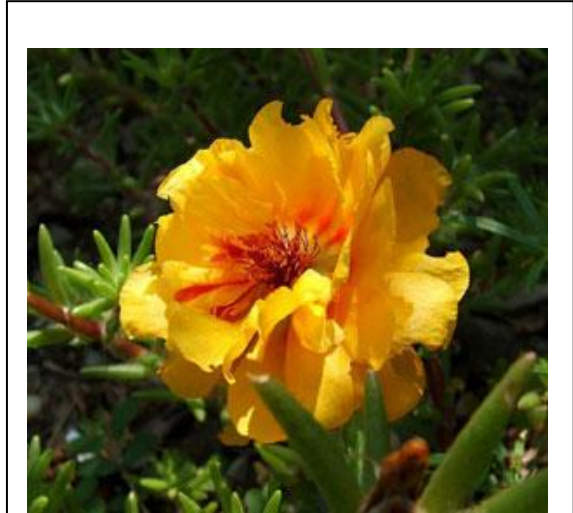
The miracle of summertime, Is with us everywhere, The fragrance of flowers, Permeates the air.